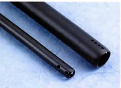
Ø5 mm/10 mm cannula