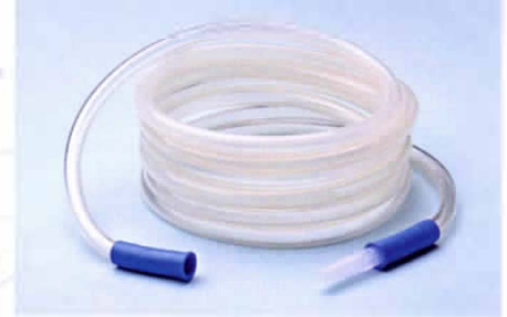
REF : RAL 3000