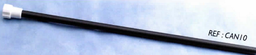
REF : CAN 10